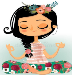
I LOVE YOGA

**Must pre-register no walk-ins accepted**